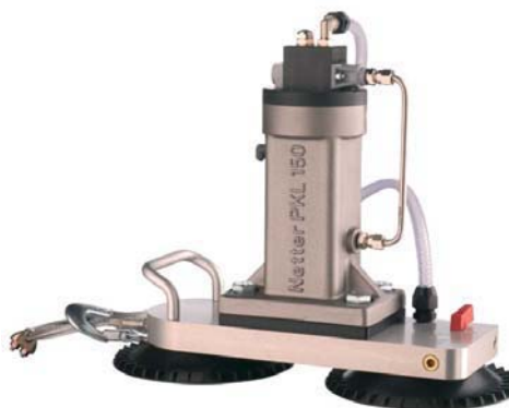
VAC 15 with PKL 150 ST