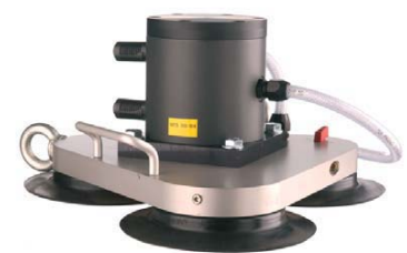
VAC 30 with NTS 50/04