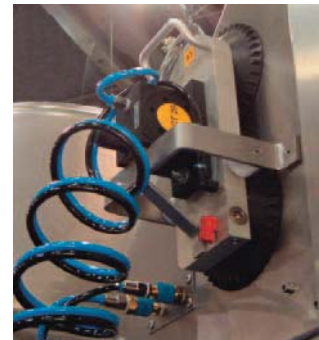
Mobile use on stainless steel container